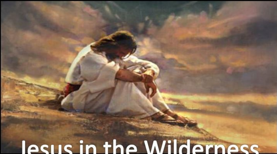
Jesus in the Wilderness