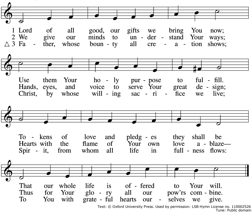
Please be seated